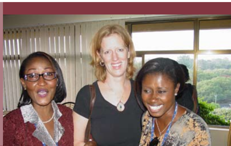
Malaria kills over 3 million people yearly. Kvinnoforum has developed a network on gender & malaria to raise the issue. Here at a network meeting in Arusha, Tanzania