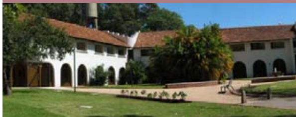
Local economical development centre, Cedral

These are spaces for services created to foster the local economy, "business incubators" in which ideas are detected, innovative spirit is encouraged and training and capacity building is offered. Both traditional enterprise training, like business plans, accounting, marketing and management, but also specific training in other competences like "how to produce your own seeds in laboratory for mushroom production", negotiations, computer knowledge, recycling, and other has been offered. More than 600 hundred courses have been implemented during the project period. 125 companies have been started of which 65% are managed by women. The survival rate of the new companies is around 80% after a three year period, which normally is around 25%.