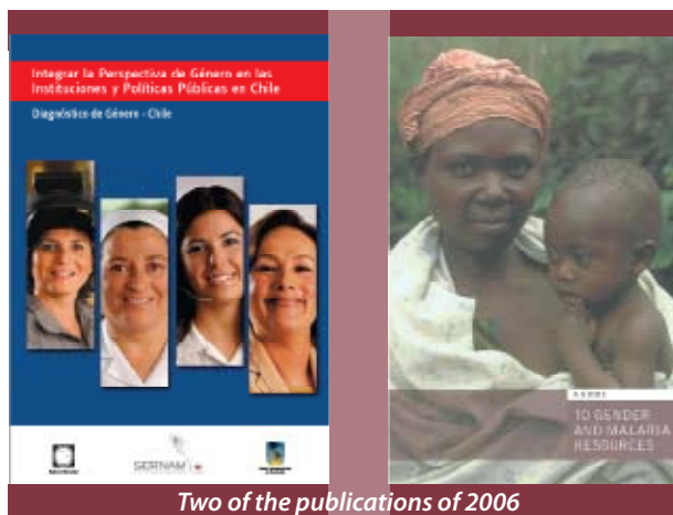
Two of the publications of 2006