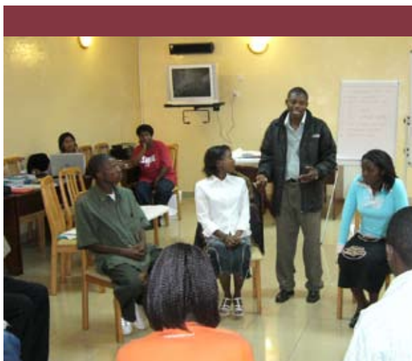
Some of the 50 peer educators that has been trained during 2006 in Zambia

Kvinnoforum has responded to a broad range of inquiries related to gender equality, empowerment and trafficking in human beings. For instan-