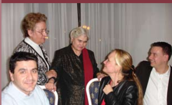
An important part of the anti trafficking work in Russia is the meeting between authorities and NGOs. Here with Swedish prosecutor and NGOs from Angel Coalition, Russia.