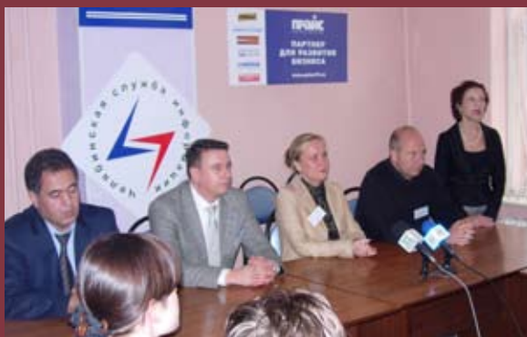
Safe return and recovery pressconference, Chelyabinsk, Russia

Kvinnoforum initiated in April 2006 a three-year project funded by Sida that aims to enhance the effectiveness of Swedish and Russian authorities in the Republic of Karelia, Leningrad Oblast, and Murmansk Oblast in combating trafficking in human beings. It is a project which aims at deepening the work initiated in the region through the pilot project Safe Return and Recovery I (2004-2005). The project will develop new knowledge and tools relevant for the work of the authorities. The officials both in Sweden and Russia lack cooperation with each other. Kvinnoforum implements the project in partnership with three