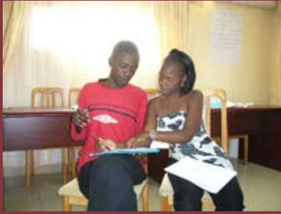
One of Kvinnoforums projects in Zambia to implement gender awareness in the work against HIV/Aids

trust from external stakeholders and institutions. Kvinnoforum role in the project was to assist PPAZ into a positive development. Important outcomes of this development have been: