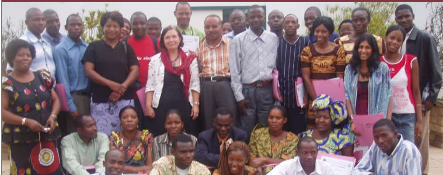
Kvinnoforum together with Trainers of Trainers for gender in SRHR and HIV work in Zambia.

number of men and women have been involved.