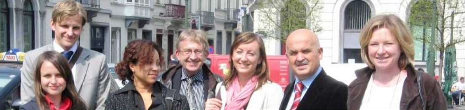
Kvinnoforums has participated in a European collaboration on mobbing of woman at the work place. Here with the project partners from: Sweden, Italy, UK, Hungary and Belgium.

Other important services at the LEDC have been: Research and preparation of innovative local projects; technical training for direct labour insertion in collaboration with the business sector; technical advice for micro and small enterprises (legal, economic, commercial, credits etc.); networking with micro- and small enterprises; conferences and exchange with other local economic development groups in Uruguay and in neighbour countries.