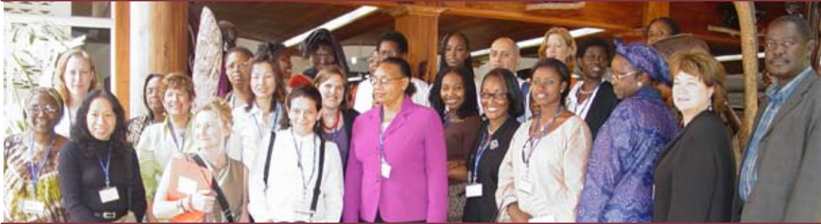
Some of the Global Gender Malaria Network members