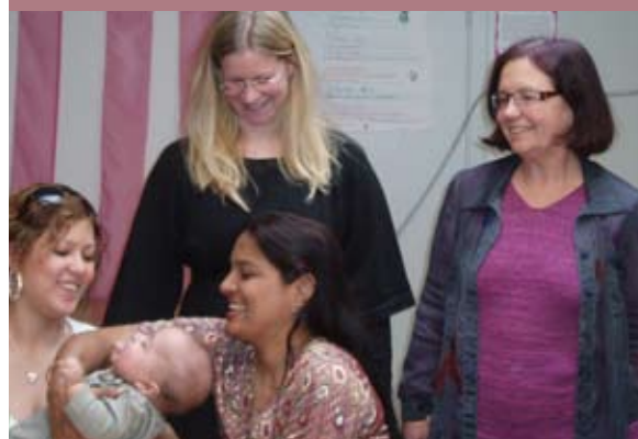
Constructive meetings between Hand in Hand and Kvinnoforum. Here in a valuable exchange of Xist methods