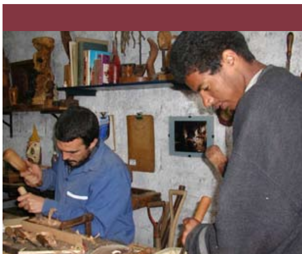
Within a EU program for the neediest groups, have a local economical development centres been evolved in Montevideo, Uruguay

With an integrated strategy two "Local Economic Development Centres" (LEDC) have been built.